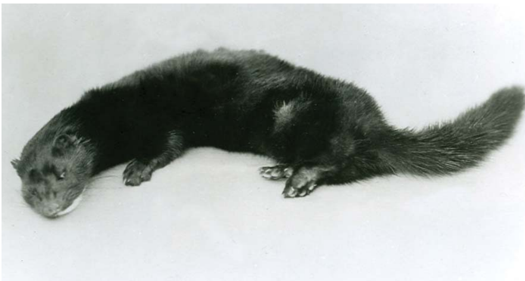
This mink was paralyzed following the feeding of fresh frozen smelt.