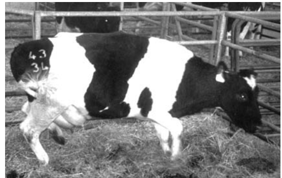
Cow affected with Mad Cow Disease, showing incoordination and early paralysis.

blood and tissue tests in a laboratory after a cow dies. The BSE brain has a characteristic perforated spongy appearance. This is why the disease is named spongiform encephalopathy.