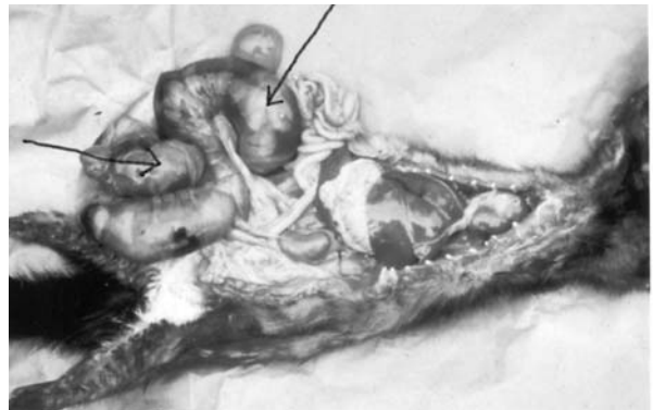
Salmonella: This uterus contains dead kits. Many kits are aborted.