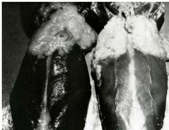
Figure 2: Pelted carcasses of normal (left) and "cotton" mink, illustrating the anemic condition of the latter.