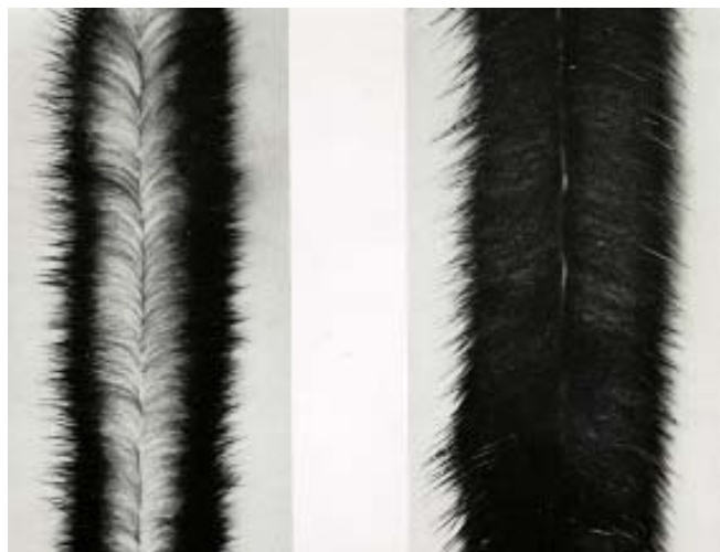
Figure 1: Pelts of "cotton" (left) and normal, dark mink, parted to show underfur.