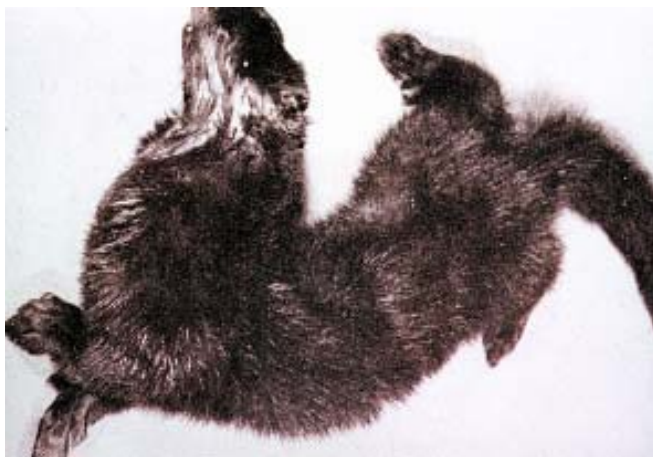
Figure 3 (Above): Mink showing paralytic symptoms caused by a deficiency of Thiamine.

Figure 5 (Below): Grey-banded pelts of standard, dark mink, resulting from a deficiency of biotin. Left - normal pelt; center - grey-banded pelt from mink fed 70% of turkey waste; right - grey-banded pelt from mink fed 50% turkey waste.